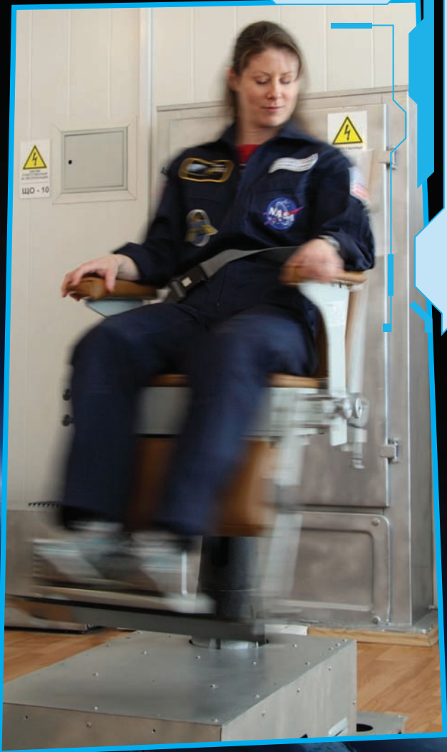
Astronaut Tracy Caldwell Dyson trains for zero gravity in a spin chair

So why do astronauts float around up there? Because we (and the ISS) are in a slow free fall! To stay orbiting around Earth, the ISS has to travel really fast—roughly 25 times faster than the speed of sound. That motion minimizes the pull of gravity, which means the ISS is not falling as fast as, say, a skydiver who jumps from a plane. But it is still falling, and so are the astronauts inside. To prevent the ISS from falling slowly back to Earth over time, visiting spacecraft that are attached to the ISS boost it back up to its orbital altitude.