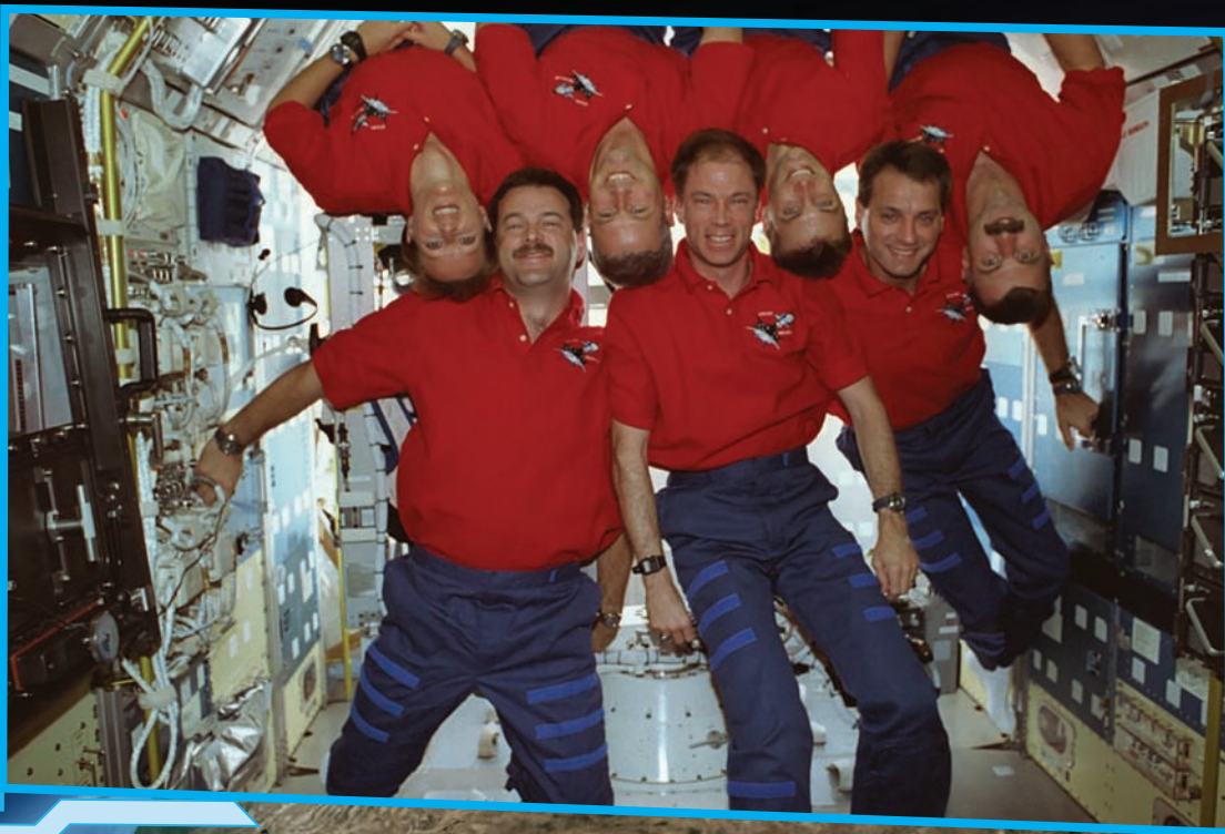
The crew of the STS-90 mission

But what happens to the human body when we no longer feel the effects of gravity, at least not in the same way we do on Earth? What happens in space?