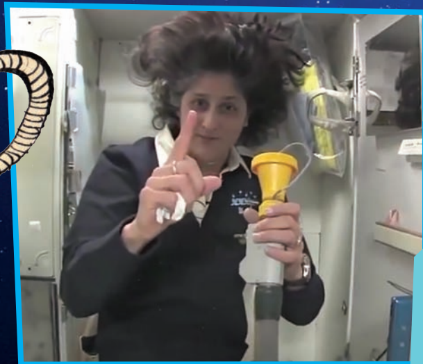
Commander Suni Williams shows a bathroom funnel on the ISS

Getting the right fit is important! Over the space-exploring years, engineers have developed urine funnels to suit female and male astronauts. On the Space Shuttle program, they were even color-coded to make sure you didn't use your crewmate's by mistake!